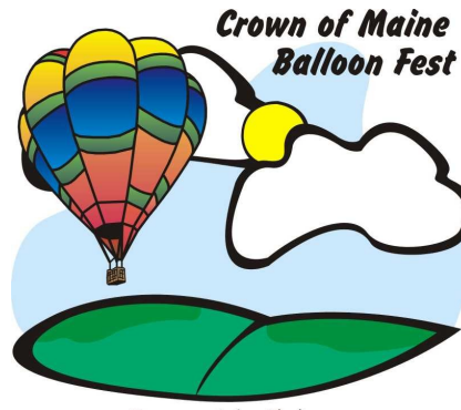
Presque Isle, Maine